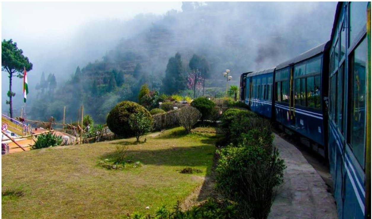
Toy Train, Darjeeling