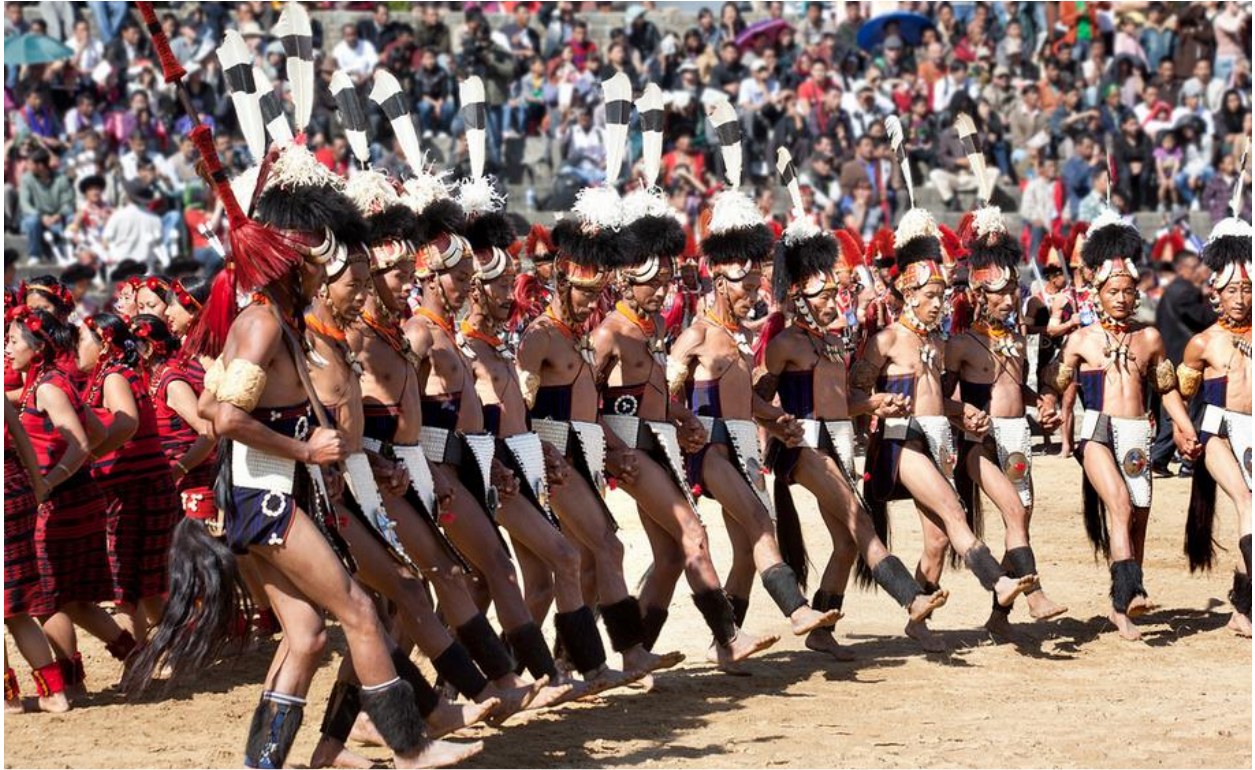
Hornbill Festival, Kohima